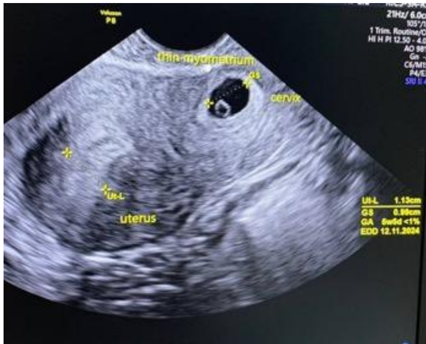
Figure 1. Transabdominal sonography results. The ultrasound revealed there is a gestational sac that was implanted into the thin myometrium, which was the scar of a previous pregnancy.